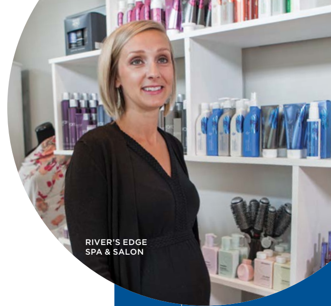
RIVER'S EDGE SPA & SALON