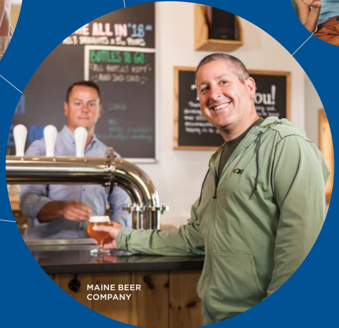
MAINE BEER COMPANY