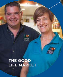
THE GOOD LIFE MARKET